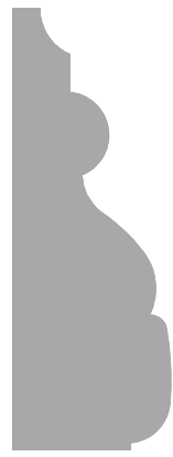
FL # 88 11/16" x 1-7/8"