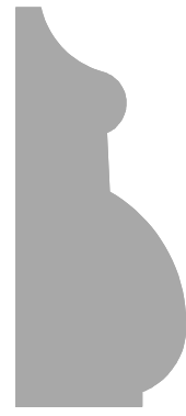
FL # 327 11/16"x 1-3/4"