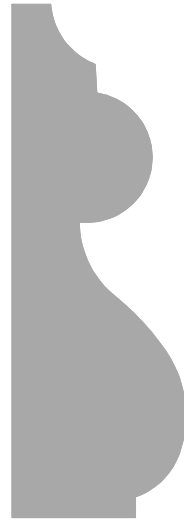
FL # 562 13/16"x 2-1/2"