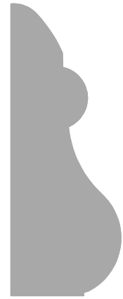
FL # 621 3/4"x 2"