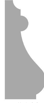
FL # 166 13/16"x 2"