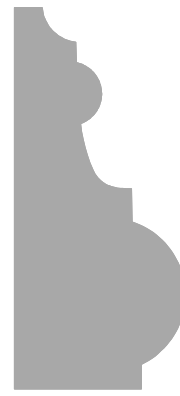
FL # 617 13/16"x 1-7/8"