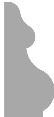
FL # 566 13/16"x 1-7/8"