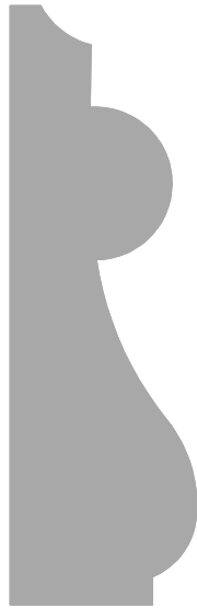
FL # 591 13/16"x 2-3/4"